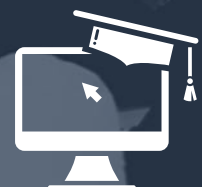
Education and Media