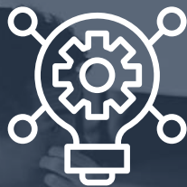
Business and Social Innovation