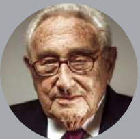
1951 Henry A. Kissinger Former U.S. Secretary of State