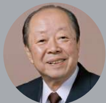
1939, 1940 Kiichi Miyazawa Former Prime Minister of Japan