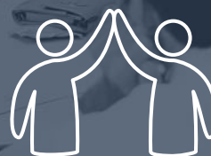
Social Justice & Cultural Identity