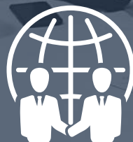
Global Governance and National Sovereignty