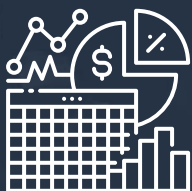
Micro and Macro Predictions of the Future