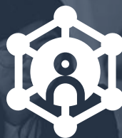
Tech Advancements and Heritage