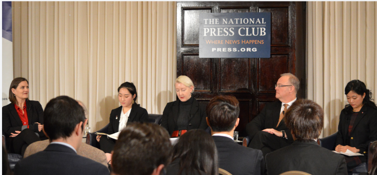
Florence (center) moderating the "Challenges in the Workplace" panel during the 5th Trilateral Symposium

"After an eighteen-month hiring process and untold years of dreaming, it actually happened. This West Coaster of modest means, graduate of no Ivy League institution and with no well-connected relatives, received... a job offer. Not just any offer: the chance to represent the American people overseas and work on the front lines of foreign policy implementation, acting on behalf of the U.S. government and living around the world. Job title: diplomat.