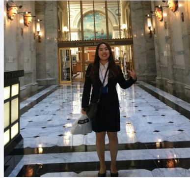
Haelee after Final Forum