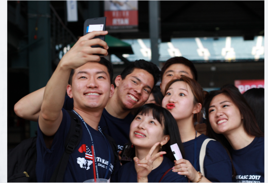
Delegates at a Texas Rangers baseball game