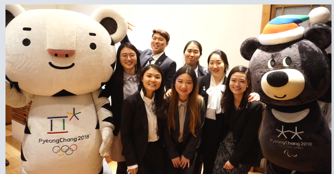
ECs with 2018 Winter Olympics and Paralympics mascots Soohorang and Bandabi at the Korean Cultural Center