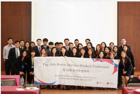
The KASC 10 Opening Ceremony held at Catholic University of America in DC