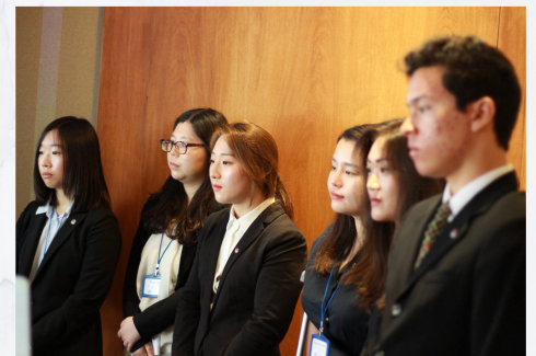
The Social Inequality RT presenting their policy recommendation at Final Forum