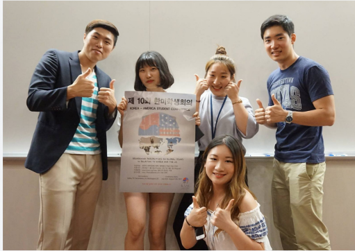
Delegates after the Talent Show in Dallas