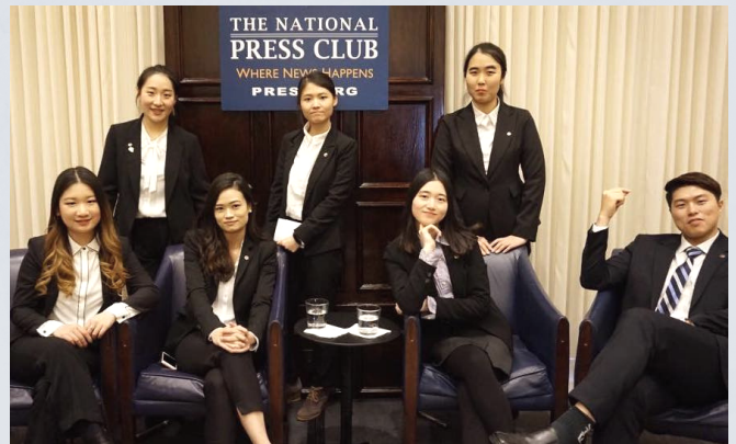
KASC 11 EC members following the Trilateral Symposium at the National Press Club in Washington, DC