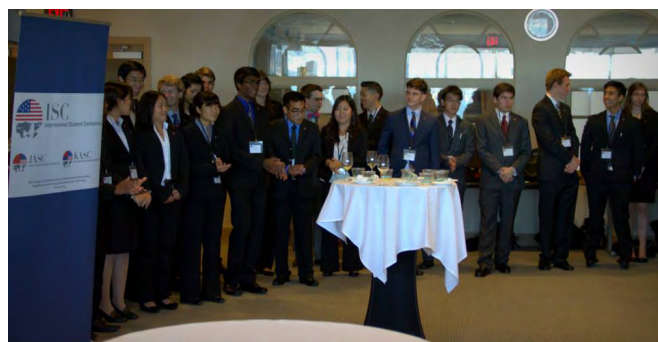
65th JASC American delegates

The 66th JASC kicks off on August 2nd in Des Moines, IA! American Orientation will begin at the end of this month, where the new JASCers will begin their month-long journey of friendship and understanding. Hosted by Grinnell College, JASCers will explore the special and long-standing relationship between Iowa and Japan, specifically, how agriculture has influenced this relationship. The delegation will also spend an entire day with the Meskwaki Settlement, a local Native American tribe. There, they will learn about the settlement's food sovereignty, tour their farms and gardens, and have a traditional lunch with tribe members. JASCers will also host a forum on agriculture with speakers from local universities that specialize in agriculture and agricultural law, Iowan farmers, and experts from the World Food Prize. JASCers will also have the opportunity to tour the World Food Prize Foundation.