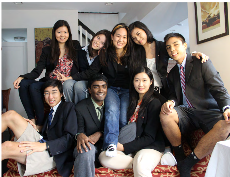
66th JASC Executive Committee

Though the month long journey will go by very quickly, the friendships and newfound understanding established between delegates will last a lifetime.