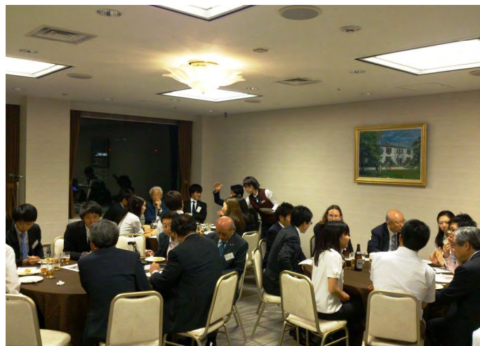
3rd Salon de JASC on June 11

Many of Japanese alumni of JASC attended “Yokoso Senpai” welcome reception hosted by 66th JASC delegation on Saturday, May 3 at Yoyogi National Olympic Memorial Youth Center. We were very pleased to meet the new and strong Japanese delegates selected by 66th JASC JEC.