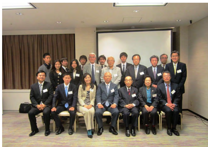
2nd Salon de JASC on April 19

Secretary General, JASC Alumni Association (JASC 32 & 33)