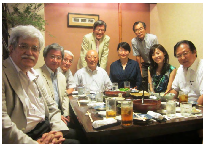
A dinner after 3rd Board Meeting of JASC Japan on July 12