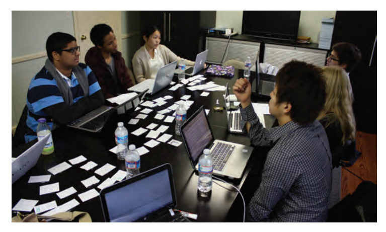
The 65th JASC Executive Committee Selects delegates for the 2013 conference during their spring meeting in March

email jasc@iscdc.org for information or call 202-289-9088