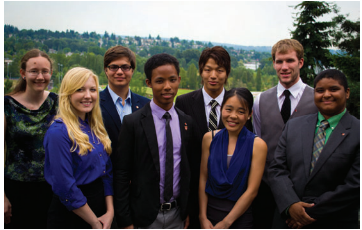
The 65th JASC AEC

The 65th Executive Committee is working hard to plan this summer's conference. Currently, our main focus is selecting delegates, and we are reading through dozens of applications. Thanks to everyone who has helped us with recruitment so far, we have received over 80 applications from talented students eager to become JASCers. Our goal is to select a group of delegates with a variety of personal and academic experiences and a desire to delve deeply into the Roundtable topics with an appreciation of the multitude of perspectives on each issue.