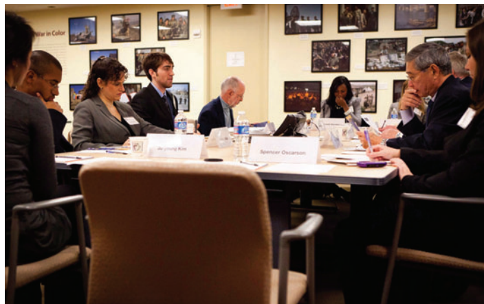
ISC's 2013 Fall Board Meeting

The plan will break down ISC's Organizational Activity into 4 core functions: