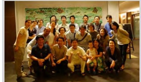
A 44th and 45th JASC Reunion