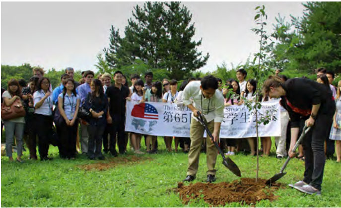
JASCers plant a tree commemorating their visit to Miyako City which was devastated by the 2011 Earthquake and Tsunami.

At the conclusion of the conference, delegates gave presentations to the public at the Final Forum.